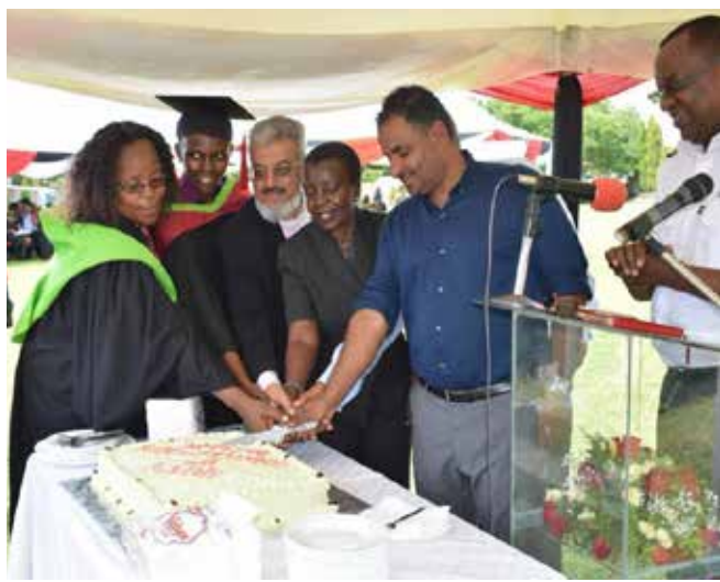
Mombasa, Kenya - 14<sup>th</sup> EACFFPC Graduation Ceremony - 2017